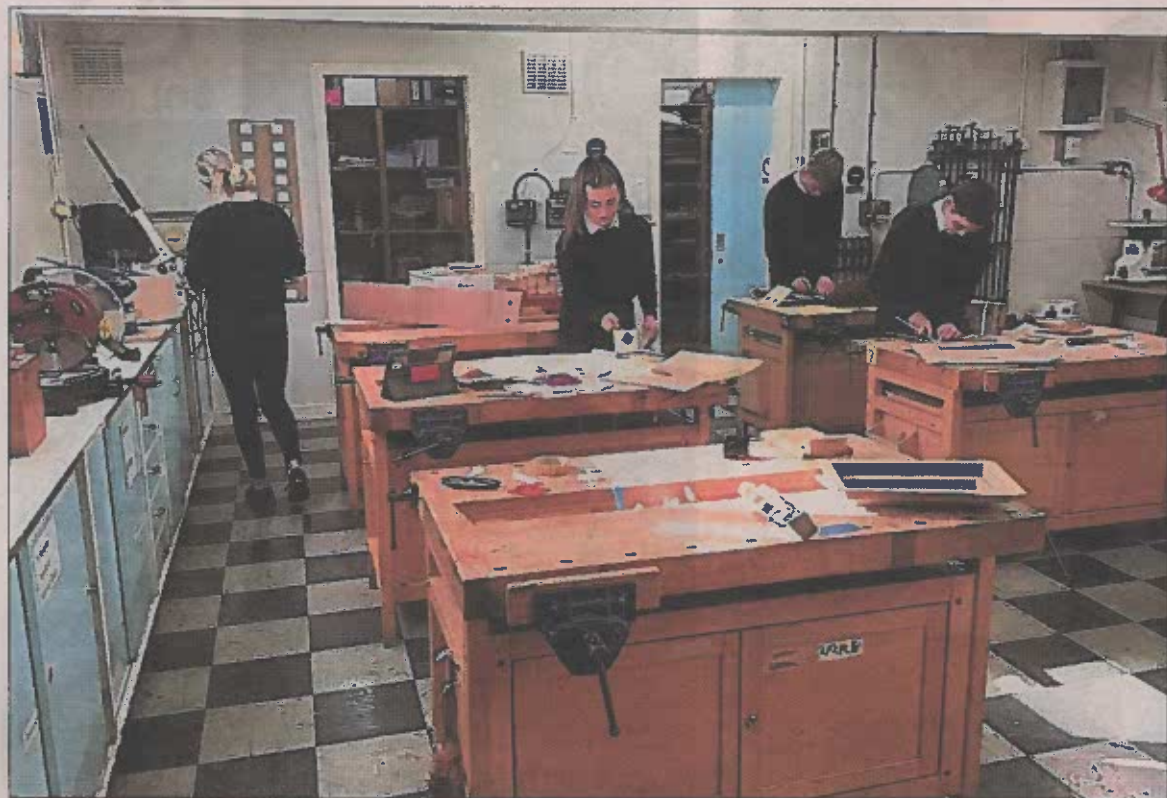
Selkirk High pupils in the workshop