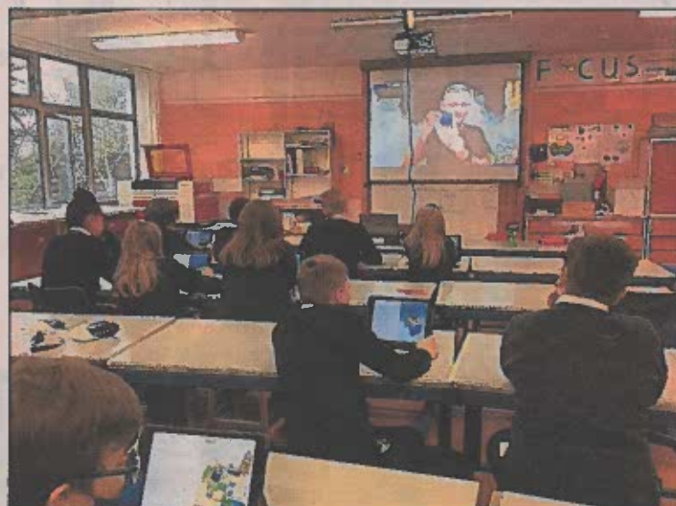
Students took part in EU Code Week