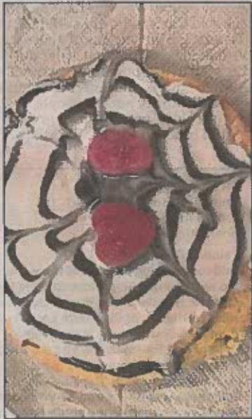
A spooktacular cake made in Home Economics

Milestone Garden Centre in Newtown St Boswells. They learnt about the structure of the bulb and how it protects the plant over winter, before planting several hundred bulbs. These and other plants will become merchandise for a business run by the Senior phase Employability and Enterprise class as part of their 'Enterprise' unit. The students created a business idea, called 'Only Plants'; have written a business plan; and are almost ready to go into production. They have decided to utilise the extensive rural area at Selkirk High School to grow and sell various flowers and vegetables. They plan to work alongside the S2 rural classes and the staff involved and will experience various aspects of business, including production, marketing and financial management.