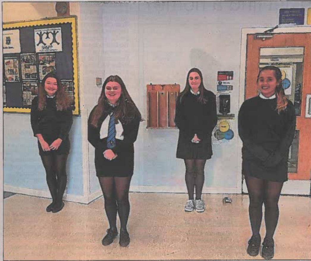
The Young Leaders who will take part in the programmes