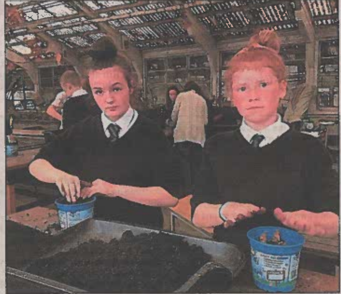
S2 pupils have been planting daffodil bulbs