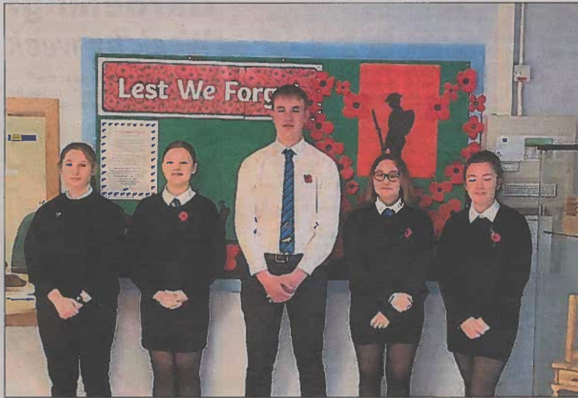
The Head Team delivered a virtual assembly