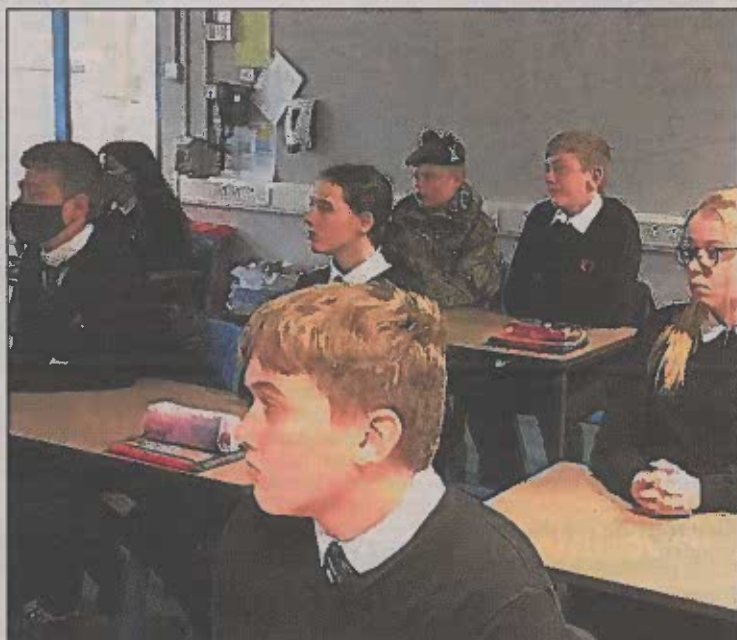
Students paid tribute to those who made the ultimate sacrifice