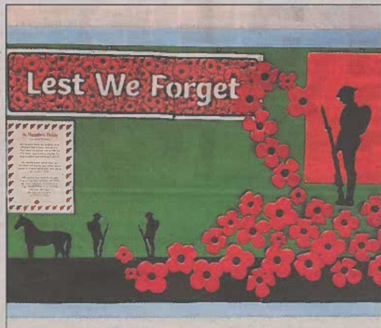
One of the displays on show at the school