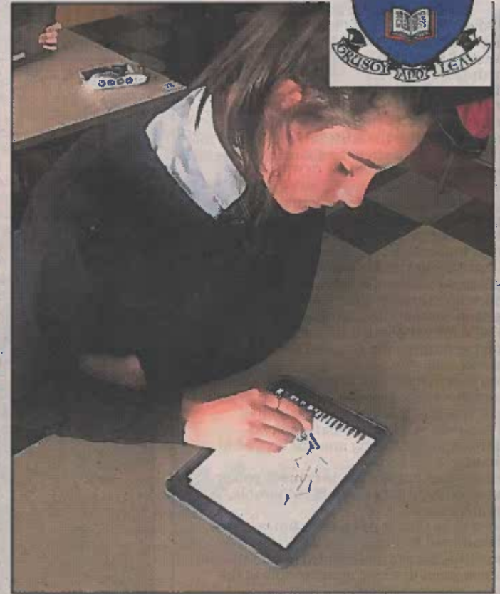
Pupils used the 'Sketches' app