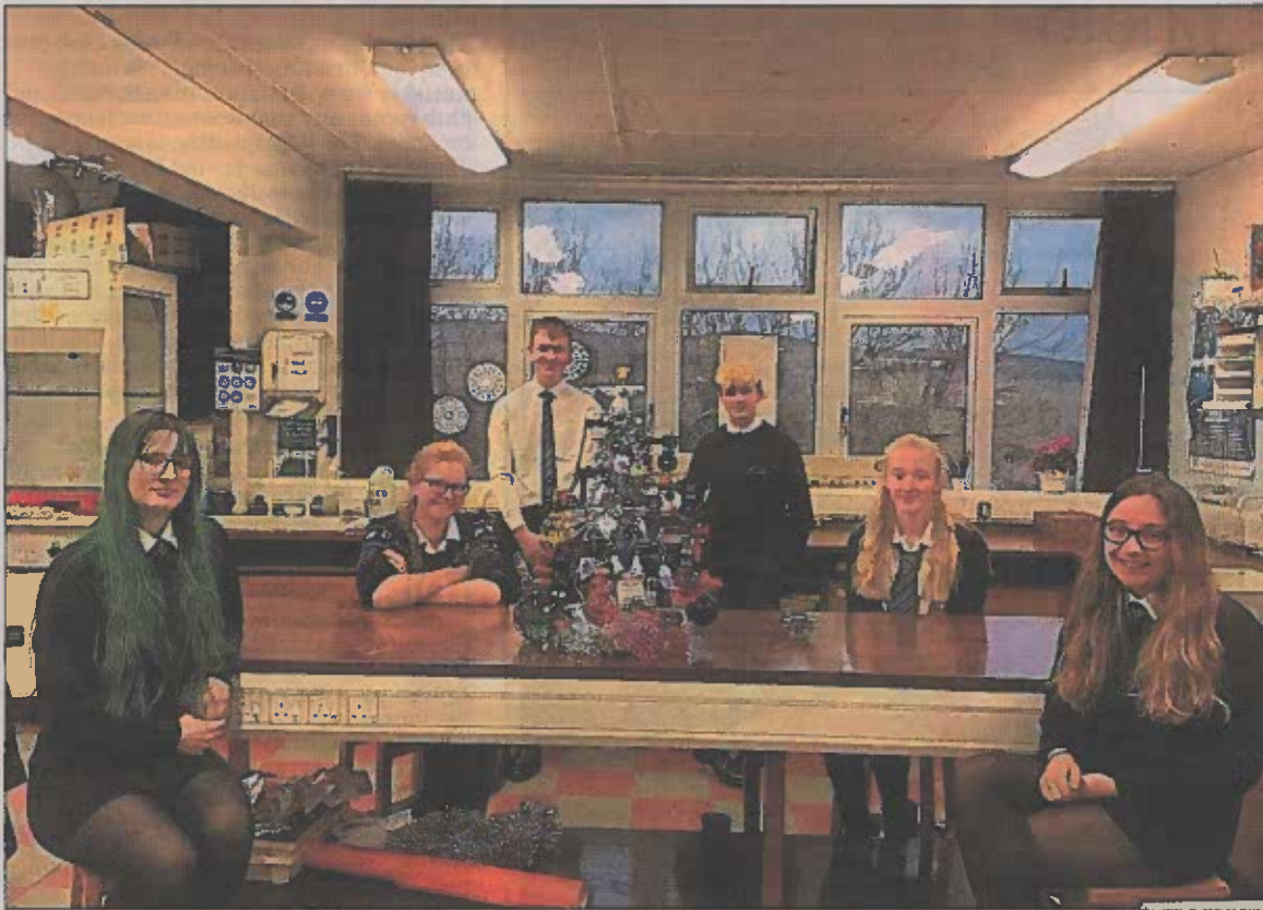
AH chemistry students with their Chemis-tree and COVID decorations