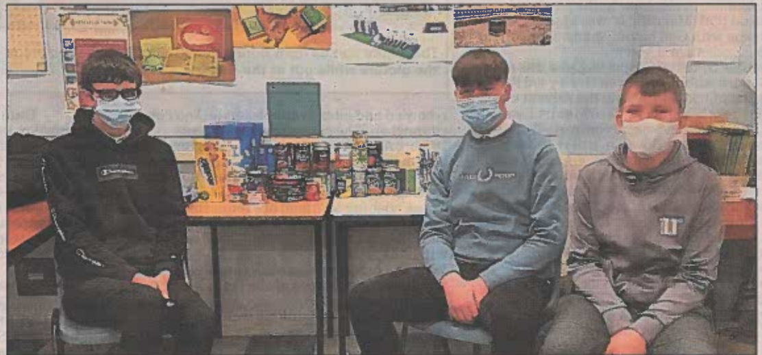
Selkirk High has been collecting items for the local foodbank

Our National 5 practical cookery class enjoyed celebrating St Andrew's Day by making a Scotch lamb dhansak with flatbreads. Thank you to Institute of Auctioneers and Appraisers and Quality Meat Scotland for providing lovely lamb for us to use.