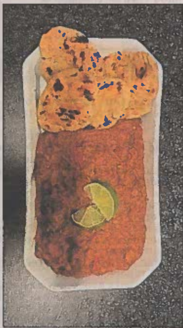
One of the curries made in the home economics lesson