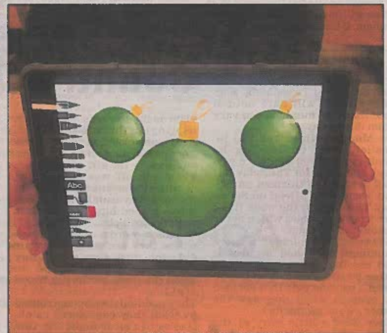
The designs were created on their iPads