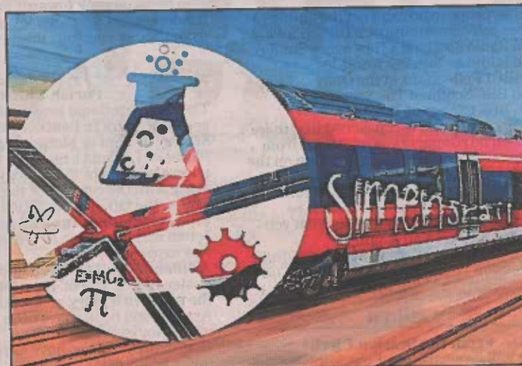
Examples from the national rail competition