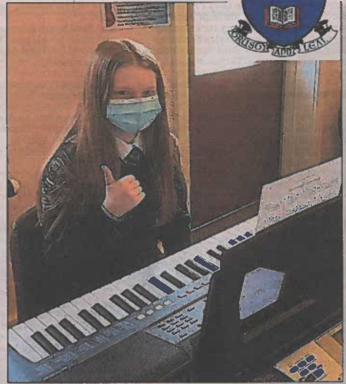
Classmates are enjoying reconnecting with friends