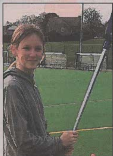
Students are enjoying practical activities