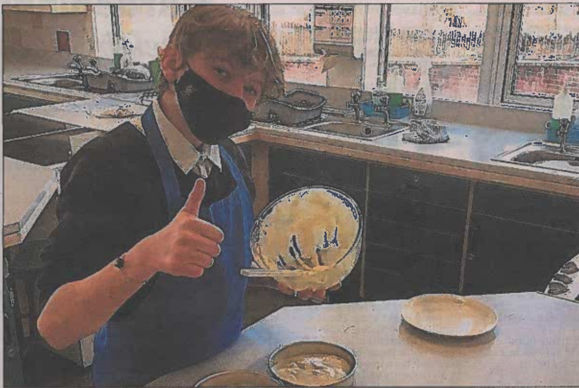
Pupils are delighted to be back at Selkirk High School