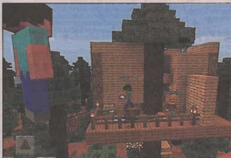
S1 students recently ventured into the world of Minecraft