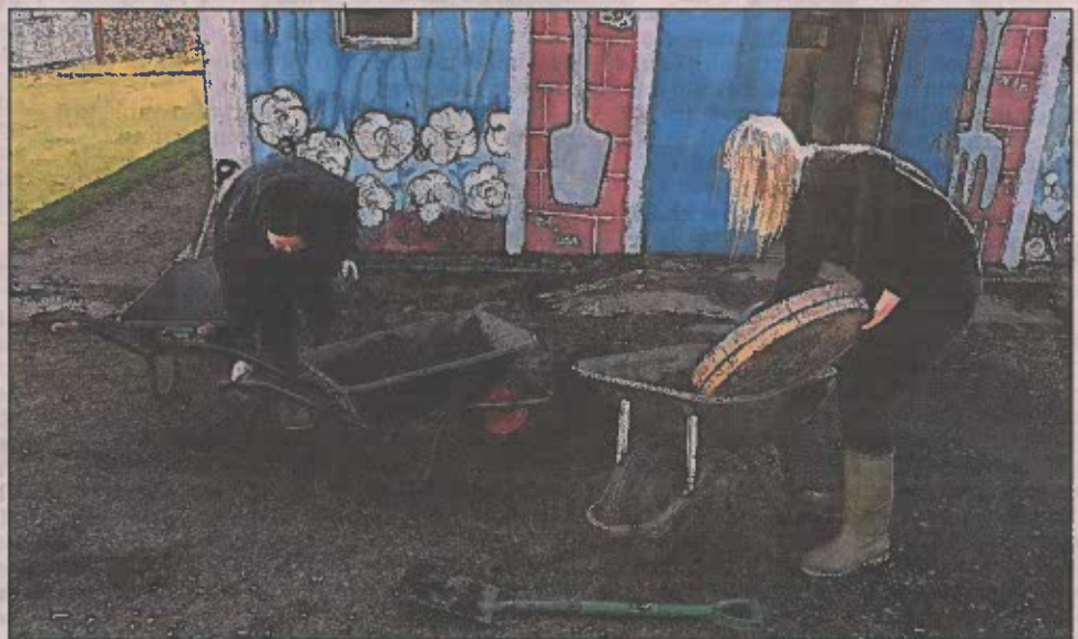
Pupils getting involved in the 'Only Plants' social enterprise