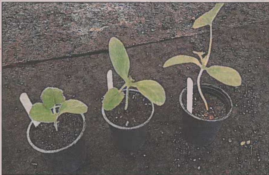
Some plants are already on sale