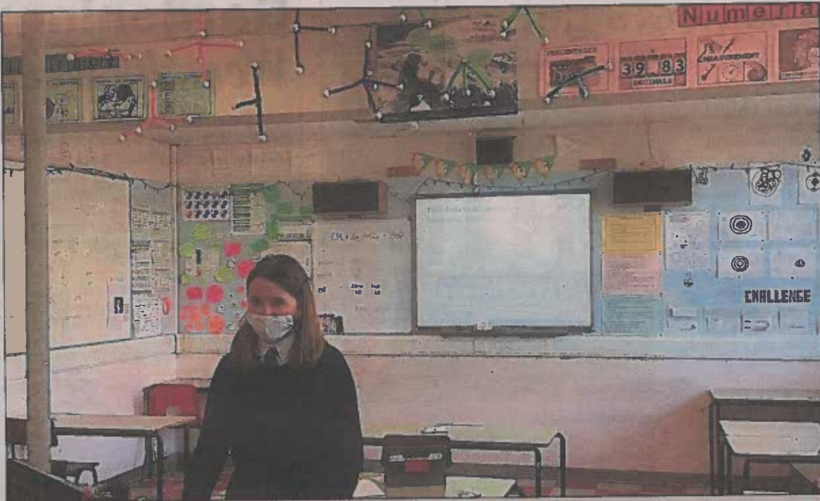
S2 students had an introduction to debating