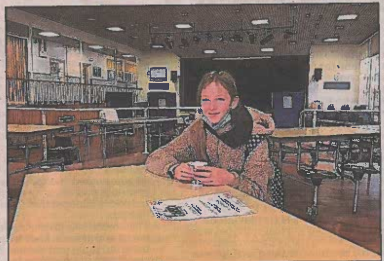
Hot and cold drinks were served