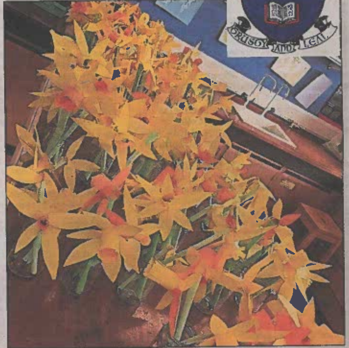
Pupils made daffodils for members of staff

The home economics department would like to wish everyone a happy Easter and a good holiday. Our wonderful survival cookery students have created these Easter nest cake delights whilst the S3 students have been making Easter buns.