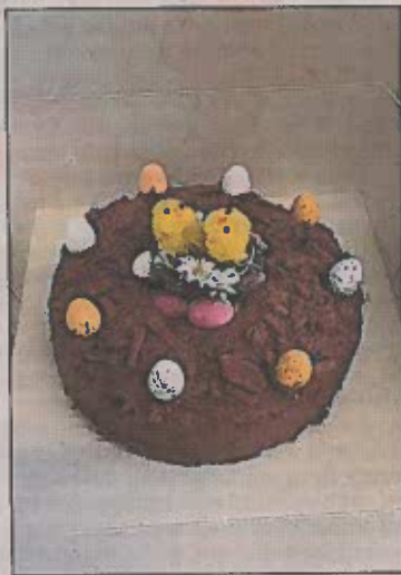
One of the cakes made by pupils