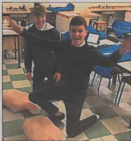
The Skills For Work Health Sector class are completing their Emergency Care assessment