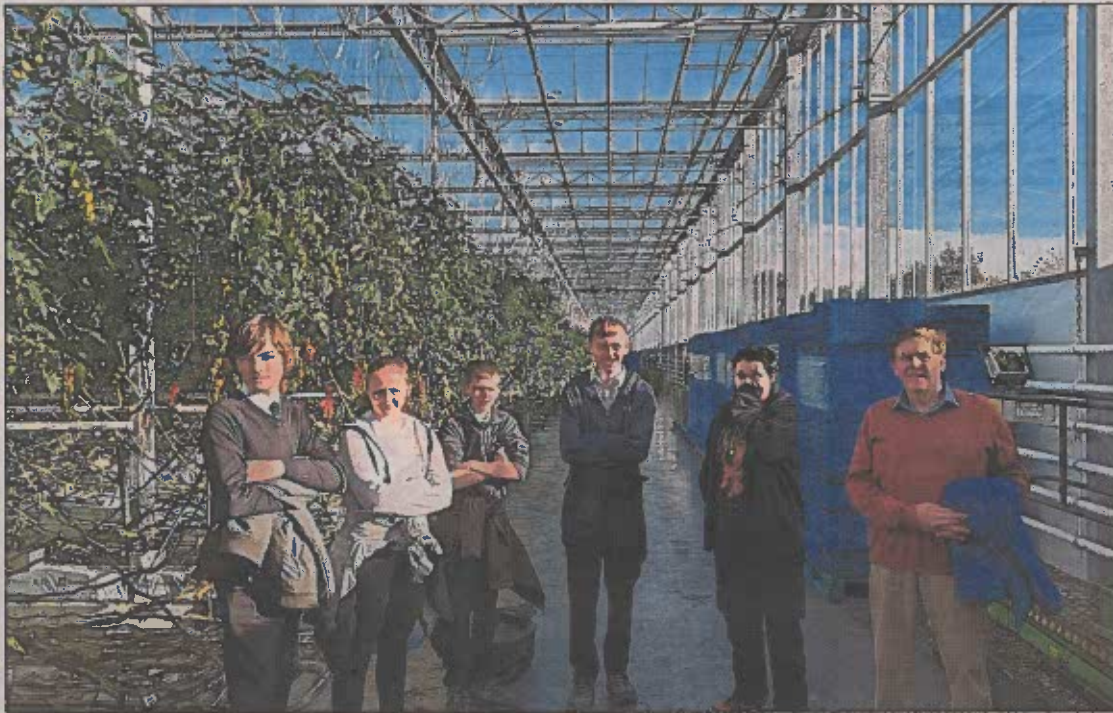
Senior horticulture pupils spent a day visiting different farms in the area

Reel Book Club – Film Review We are a new extra-curricular club at Selkirk HS which looks at movies, podcasts and books. Because of Halloween, we have been watching the brilliant, supernatural movie The Woman in Black .