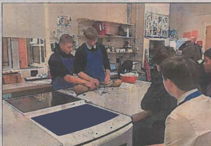
Youngsters have been learning how to prepare pheasants