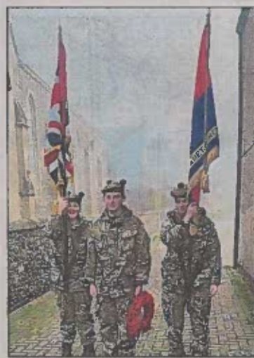
Pupils carried the standards on behalf of the Army Cadets