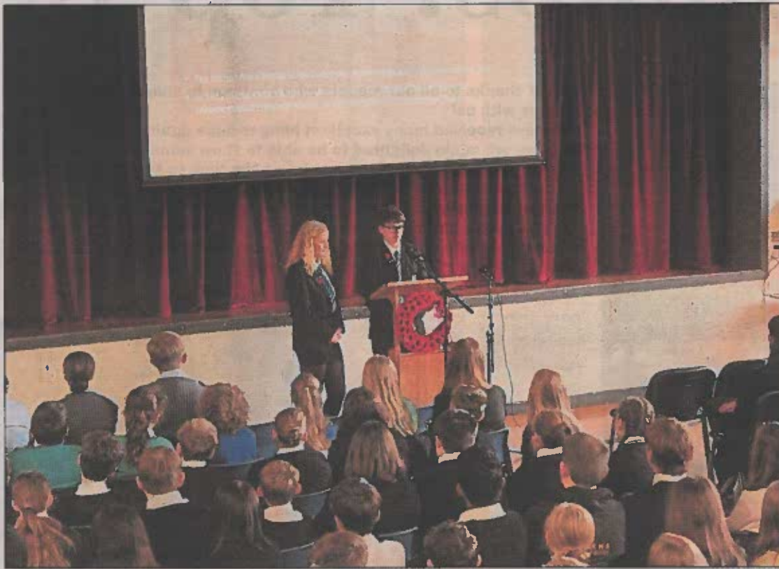
A special assembly was held at the school