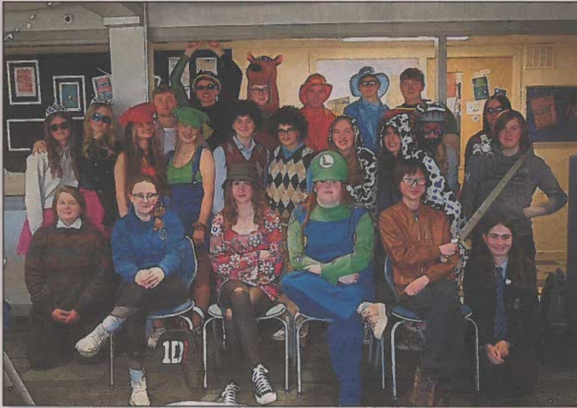
S6 had their final day before starting study leave