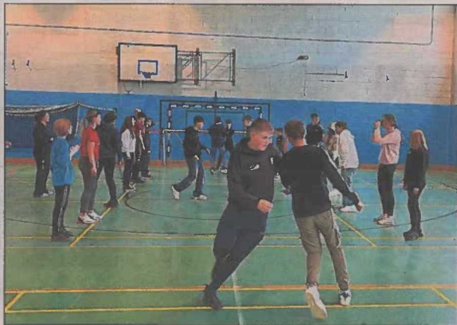
Friendships were formed between Selkirk and German pupils