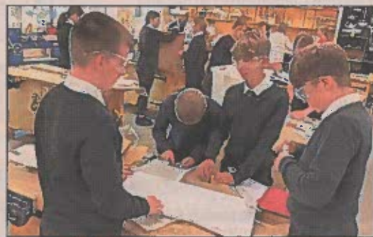
S2 completing the Dyson marble run challenge, working in teams to come up with the best design