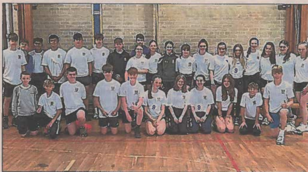
There were some outstanding performances in the track and field events