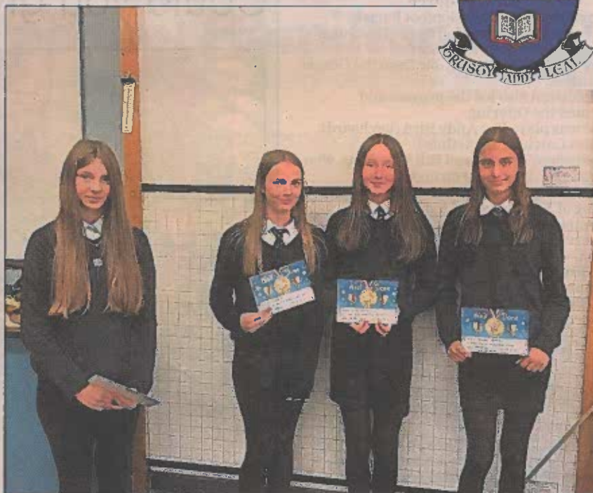
A host of pupils took part in Selkirk's Maths Circle event back in May. The best teams from each year were awarded certificates