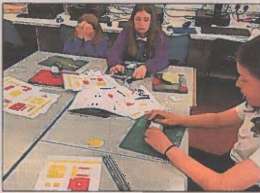
Primary 7 pupils making their 'Agreeable Sheep'