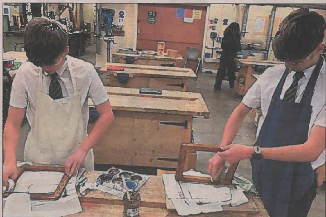
The S3s have been making mirrors using simple rebate joints

Come along and join the Community Choir. Open to everyone aged 12+.