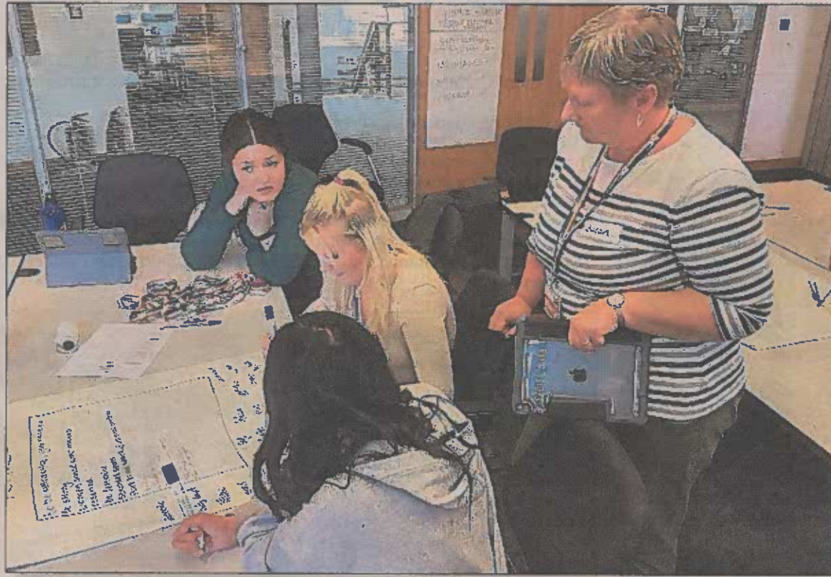
The newly-trained MVP mentors