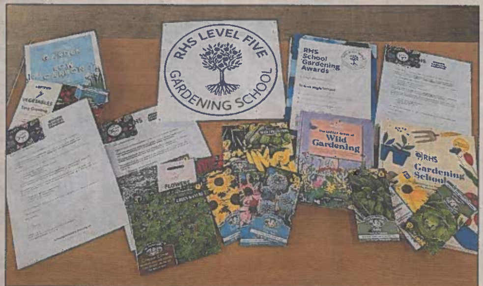
The horticulture department has been awarded the RHS Gardening for Schools Award