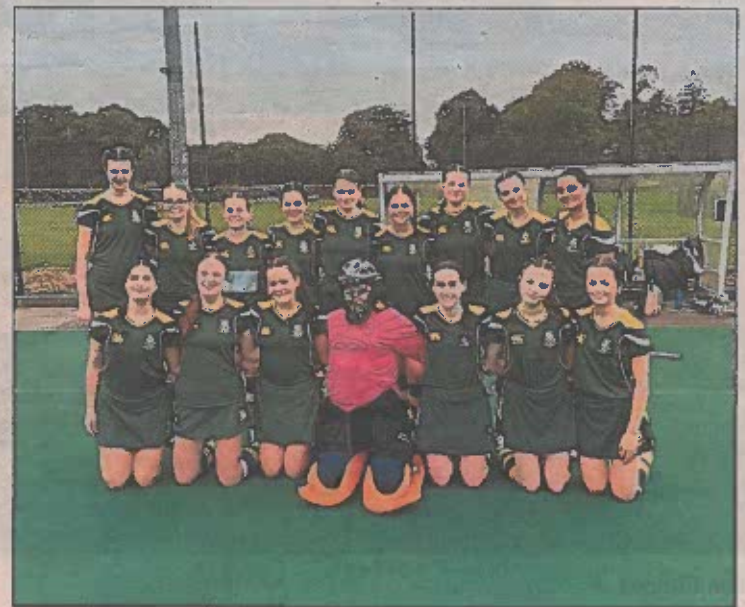
The senior hockey squad