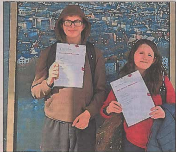
Pupils took part in Edinburgh Universities Mathematics Masterclasses