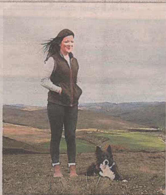
Values in Action