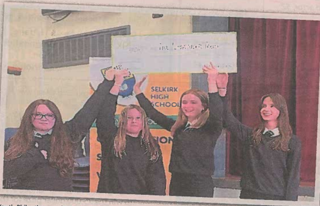
Youth Philanthropy Initiative