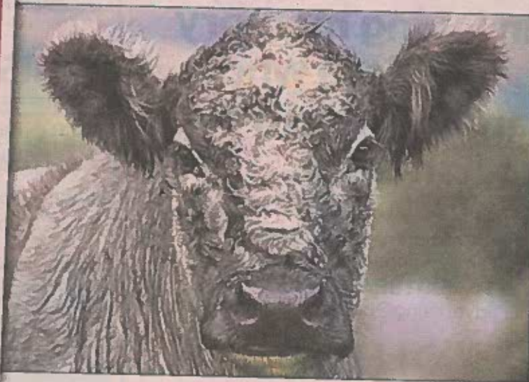
Values in Action