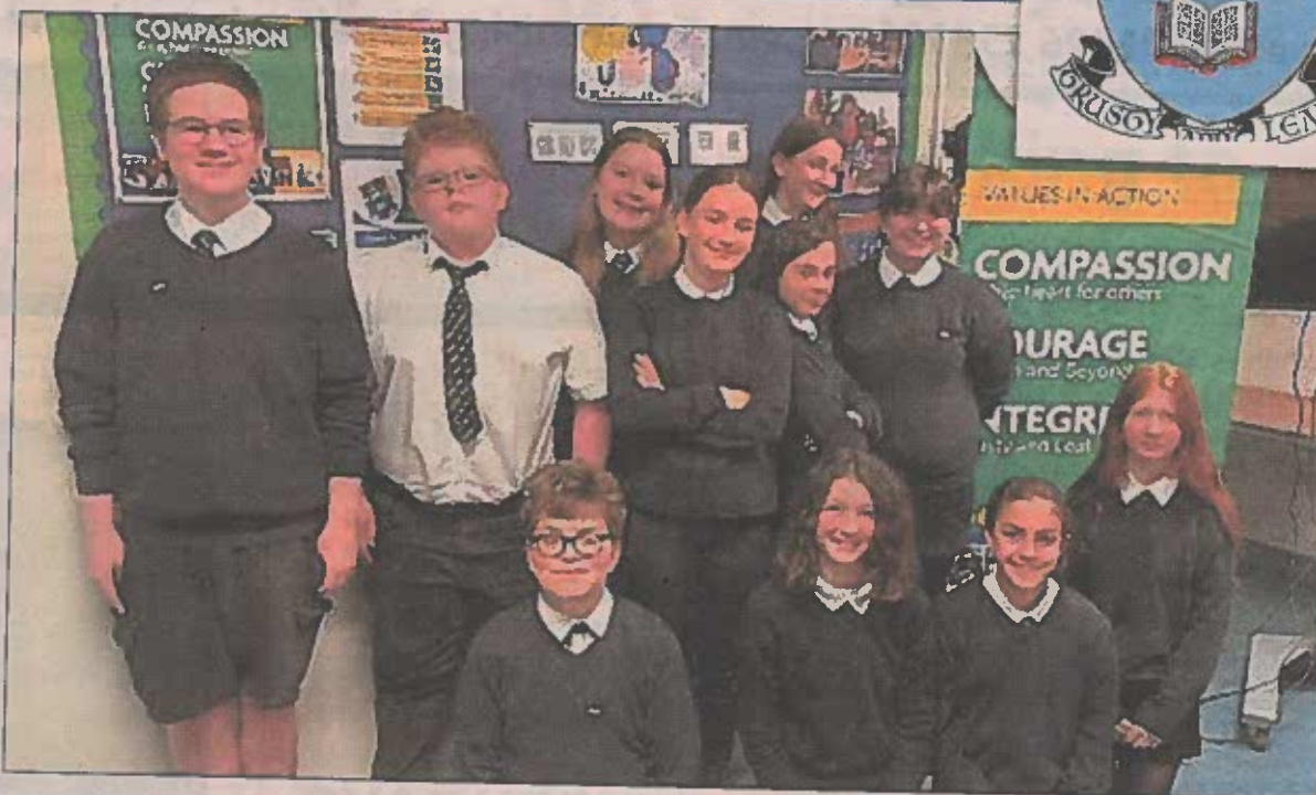
Values In Action (VIA) Friday-