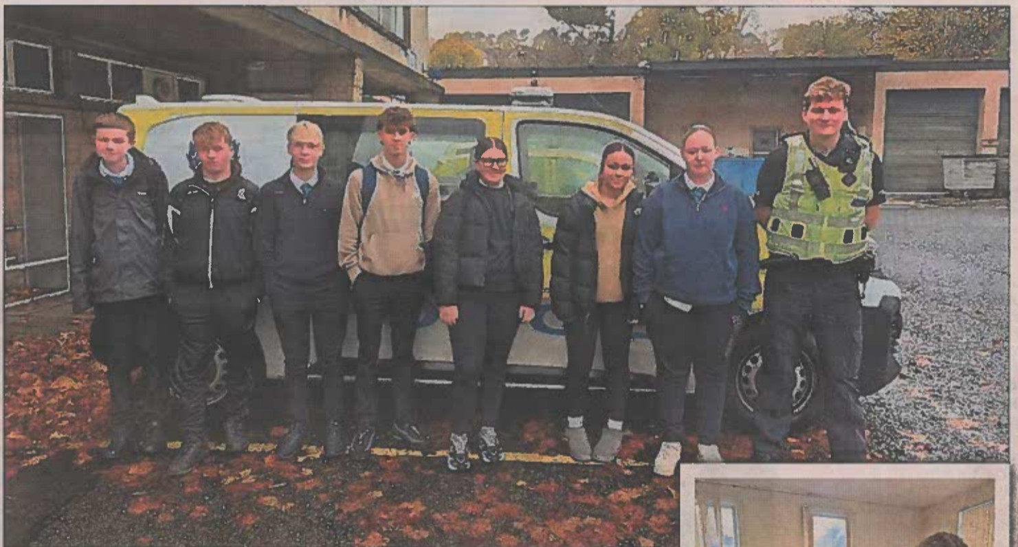
Police station visit

This year our visitors included members of the Royal British Legion Scotland, elected members, primary school reps, parents and members of Selkirk's Common Riding associations. The hall was spectacularly