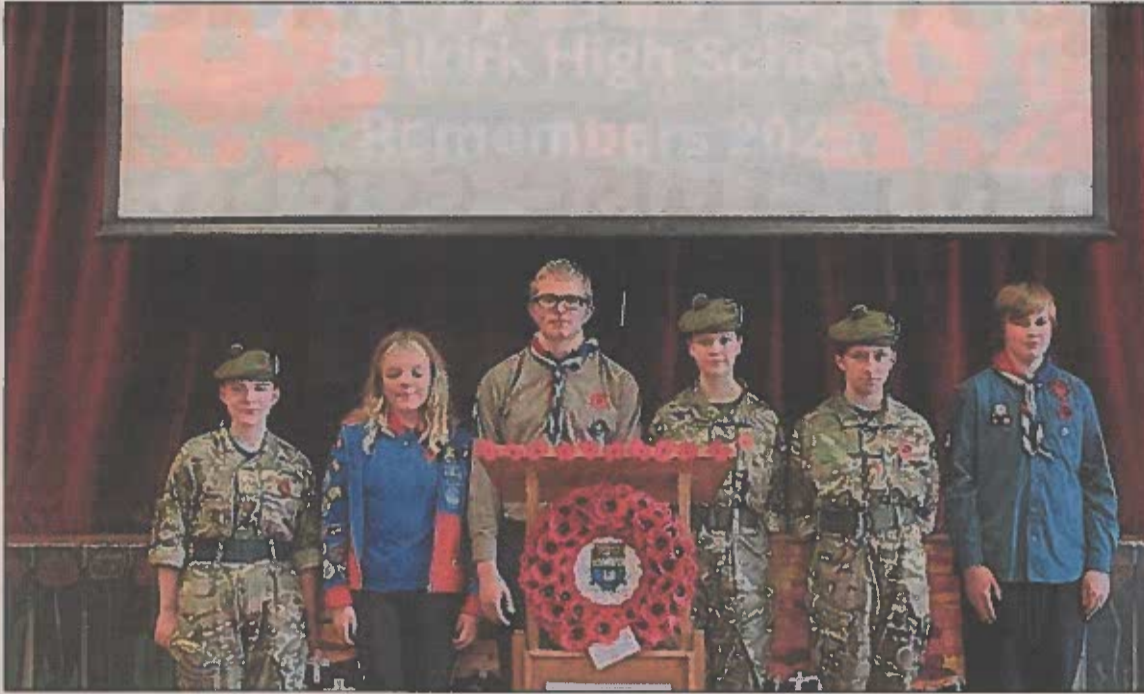
Selkirk High School remembers