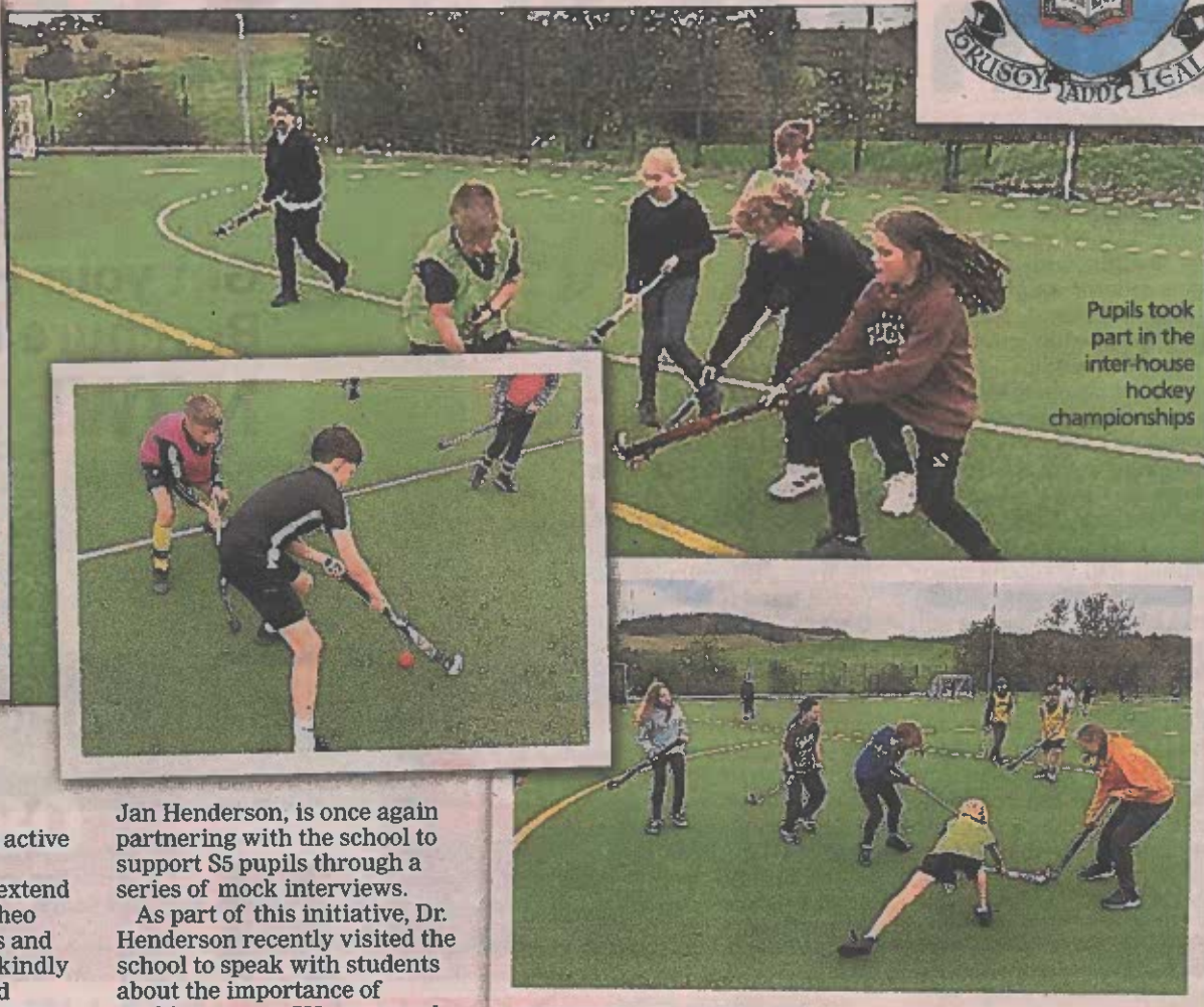
Pupils took part in the inter-house hockey championships

S1 and S2 inter-house hockey LAST week our S1 and S2s participated in their first inter-house event of the year. Having participated in a block of hockey in PE the S1s were keen to show their new skills and game understanding